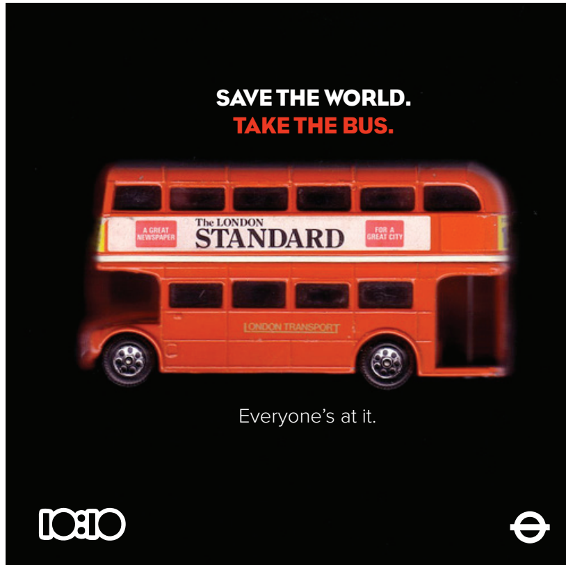
NB Mock poster

'Everyone's at it' is not the confirmed slogan, please don't use.